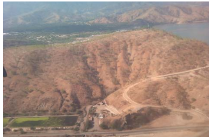
Water erosion near to Dili

This term Year 9/10 main focus in their geography unit is "The World Starts in Your Back Yard" (river studies).