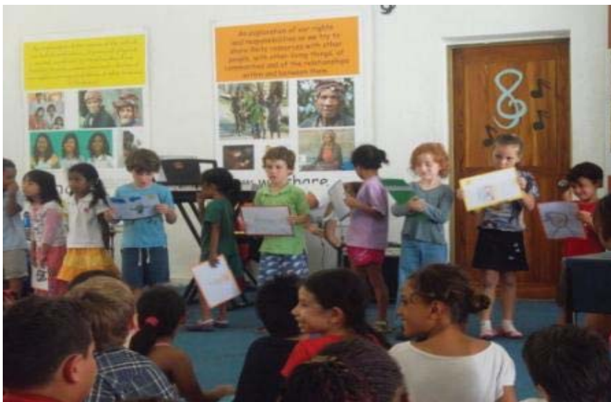
Reciting their Wind Poems

On the 24 th November, Week 8 Assembly, which was organised and hosted by the Distance Education Class, was a great success. The performances were fantastic as many students from different year levels showcased their skills and talents. Song, dance, speech, electronic presentations and playing instruments were presented with great enthusiasm. Although the assembly went over time, the audience were enjoying it and their interest was kept throughout the program.