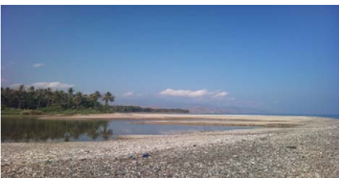
The small lake at the mouth.

We went to visit the mouth of the Comoro River eight weeks ago to investigate what it looks like and how the water escapes in to sea and we have been hoping for the rainy season to start so that we can see the difference when the river is flooding.