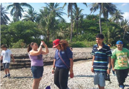
Investigating the river mouth and nearby.