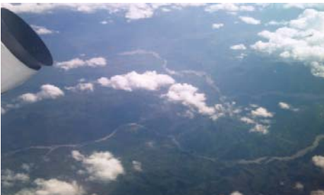
Bird's Eye view of a river in East Timor