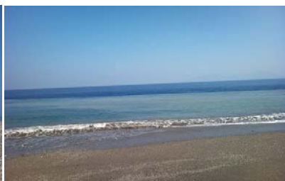
Water percolates through the rocks to the sea.