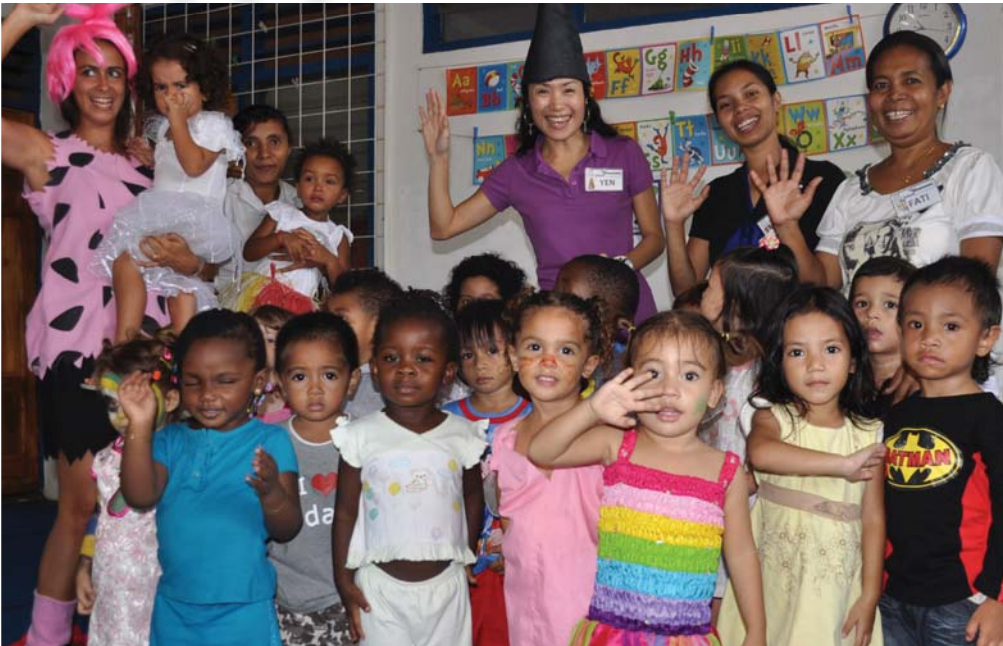
Playgroupers acknowledged Halloween last Friday with dress-ups.