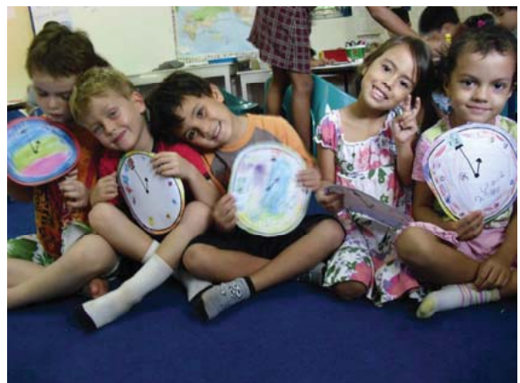
Making Hickory Dickory Dock Clocks