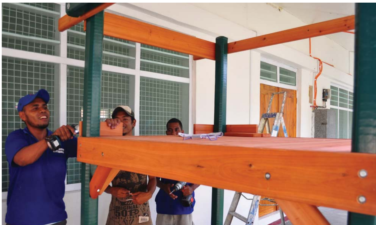
Above: Ajito putting the finishing touches to new playground equipment

The criteria and assessment to meet Candidate status is extremely vigorous and acknowledges that DIS meets this high international standard.