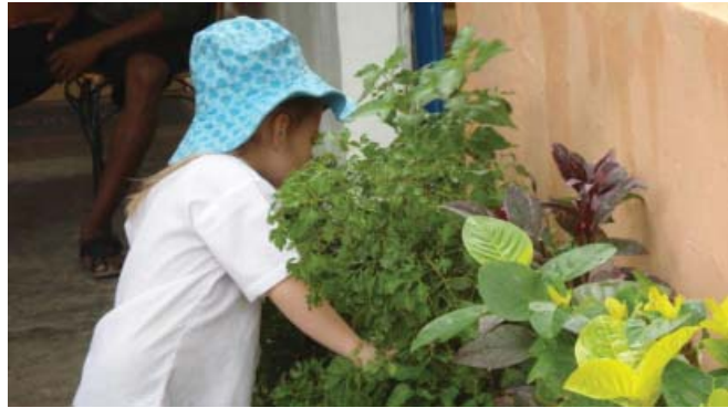
Chae's looking for hidden creatures.