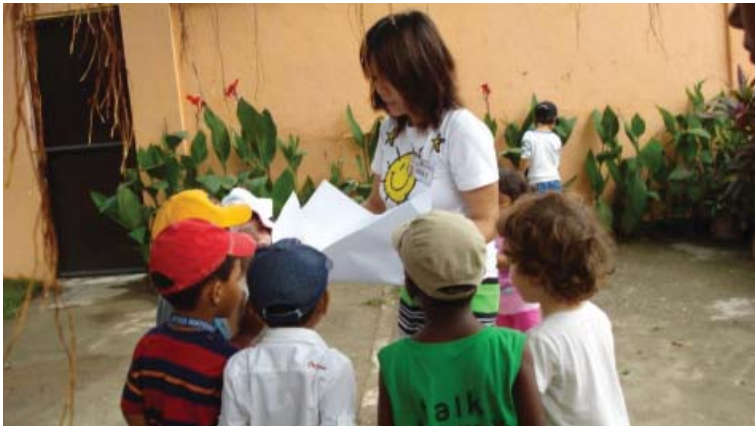
Examining what we found.

This term in Preschool students are finding out about bugs-insects and spiders, as a part of our Integrated Unit. We have started discussing what we already know about bugs, and we went on a Bug Hunt in the school yard to see what we could find. We were lucky enough to see three different types of ants, and a black bug with pincers!