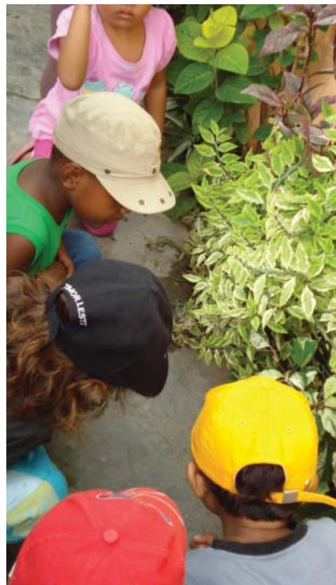
Anything could be hiding under a bush!